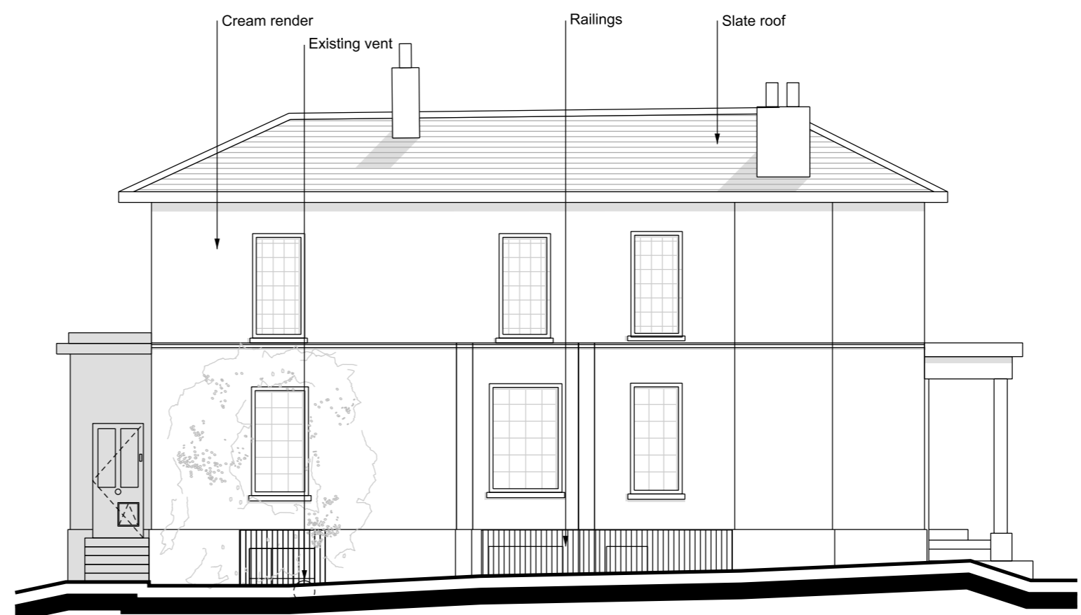
02 0021 Existing Drawings Morden Lodge 1:100@A3 West Elevation